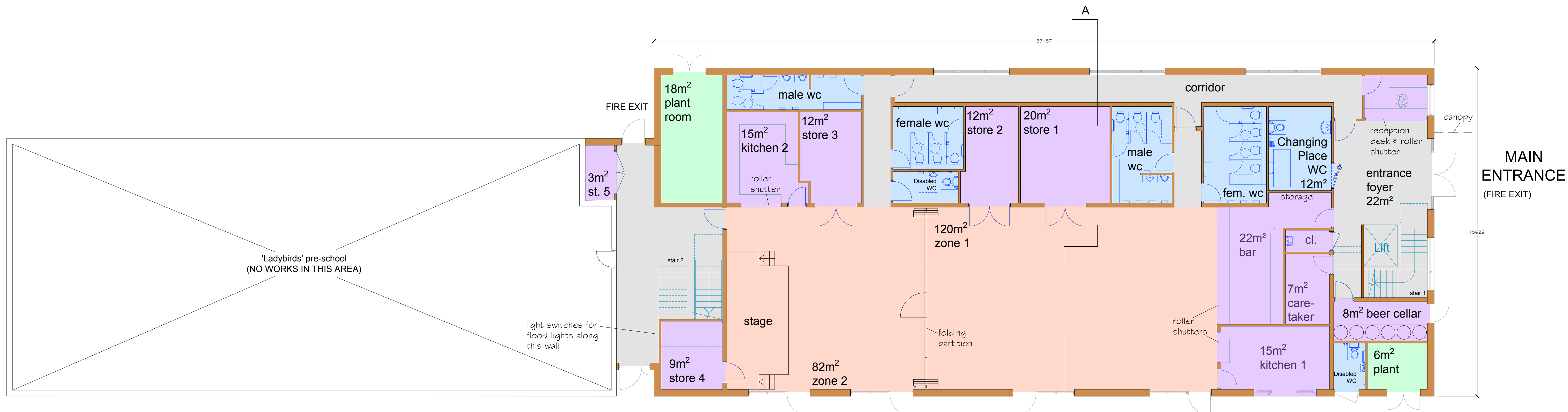
GROUND FLOOR PLAN gross internal floor area = 572.22m 2

Total gross internal floor area = 961.39m 2