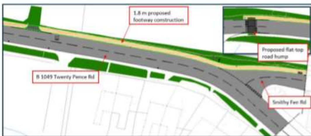
Fig 1: PROPOSED GENERAL ARRANGEMENT